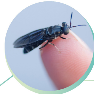
BLACK SOLDIER FLY FACILITY

Non-Biodegradables: Plastics, Wood, Paper, Metal and Rubber